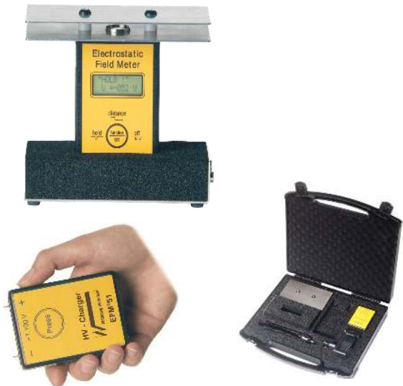
EFM51.CPS Charge Plate Kit

This document is prepared for our customers as a service, and is to the best of our knowledge true and accurate. However, it is understood and agreed by the users of this document that we will accept no liability for the conclusions reached. Users of this document may therefore wish to perform additional testing before determining that products mentioned are suitable.